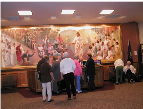
The Lobby of the Library

Tuesday: It was strange for this S.F. Bay Area gal to wake up to see snow covered roofs from my ninth floor hotel window. The streets just looked wet and the temperatures were supposed to rise but snow was forecast for most of the week. The winds died down, thankfully.