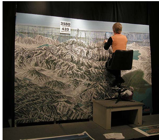
This beautiful tapestry had threads of silver, white and colors with clear beads which looked like ice crystals.

That leaves me with a lot more work to be done. One last thing; the Best Western Plaza hotel where we stayed is very comfortable with large rooms and is right around the corner from the Library. The food was very good and inexpensive. It also has an Internet connection in the room if you take a laptop and there is no charge for local calls.