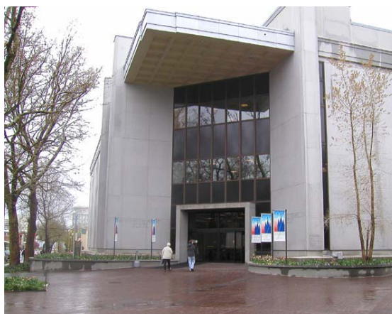
The Family History Library at Salt Lake City, Utah