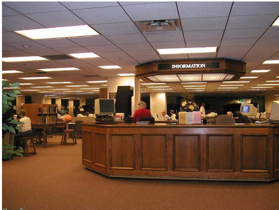
Information Center on Second Floor

This afternoon I printed out a lot of pedigree sheets at the Library with many additional ancestors. It will take me hours to put them into Reunion . The other members of the Society were doing much more advanced work than I. They were looking up wills and probates, land records,