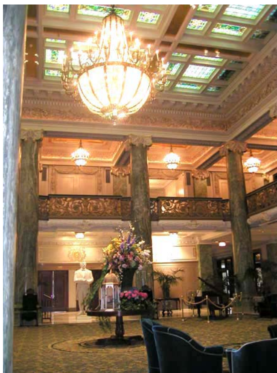
Lobby of the Joseph Smith Memorial Building

Topic: "Sharing, a Good Way to Find Your Family History"